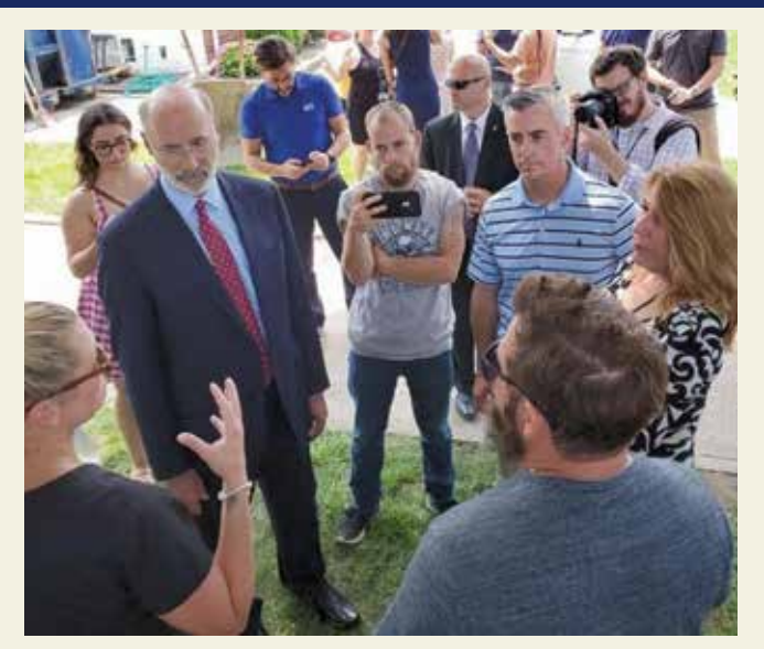
I helped establish the $1.75 million flood relief assistance program to aid more than 1,000 Bucks County residents who reported damage to their homes or businesses by severe weather and flash flooding on July 12. I'm proud to have worked in a bipartisan manner to make this program a reality.